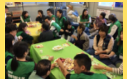
Autumn craft shop (top)

It seems that again this year, the volunteers were able to get to know the lives of and makes relationships with the individuals. And this will surely remain in their hearts.