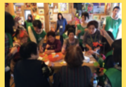
Tea Party (bottom)