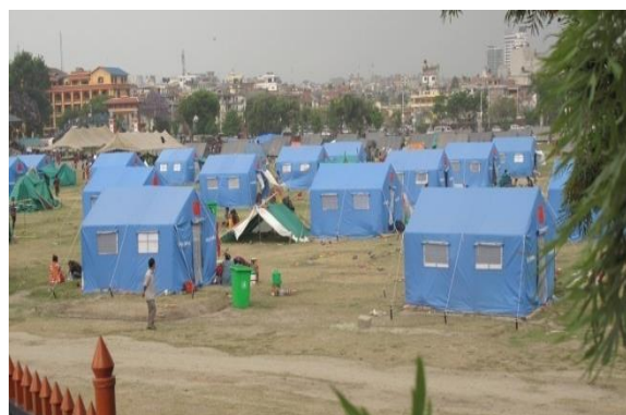
Relief tents at public ground, Kathmandu