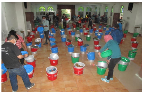
Sorting out of relief materials for 100 families