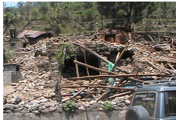
Destruction at Khadichaur villages in Dolakha district