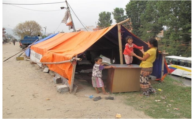
Roadside shelter in Kolangki area, Kathmandu

On 25 April 2015, earthquake with magnitude of 7.8 struck the Himalayan country of Nepal, leaving behind great devastation across the nation. The country continues to feel aftershocks causing fear and tension among the people, yesterday (May 12, 2015) series of 5 shocks ranging up to 7.3 occurred.