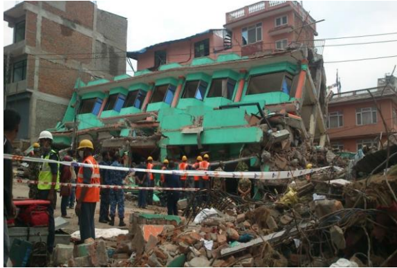
Darshan church where over 20 persons killed